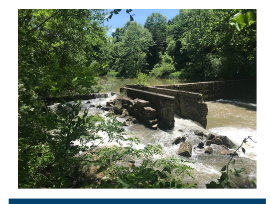
NOFO released, LOIs due, and proposals are developed.