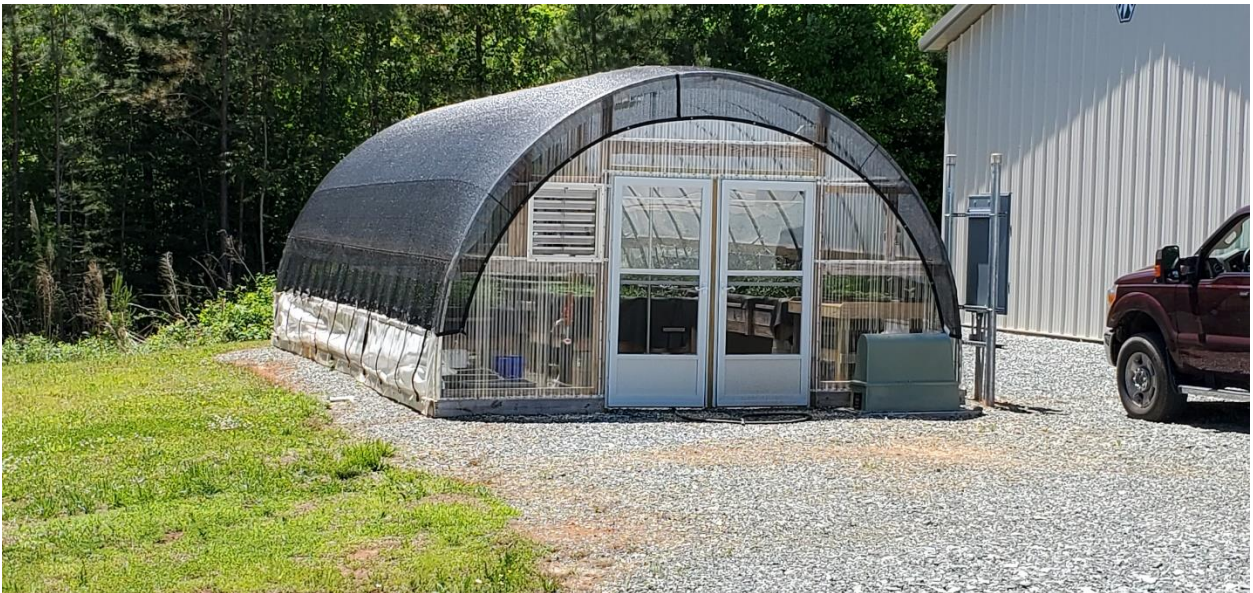
16ft x 30ft Greenhouse