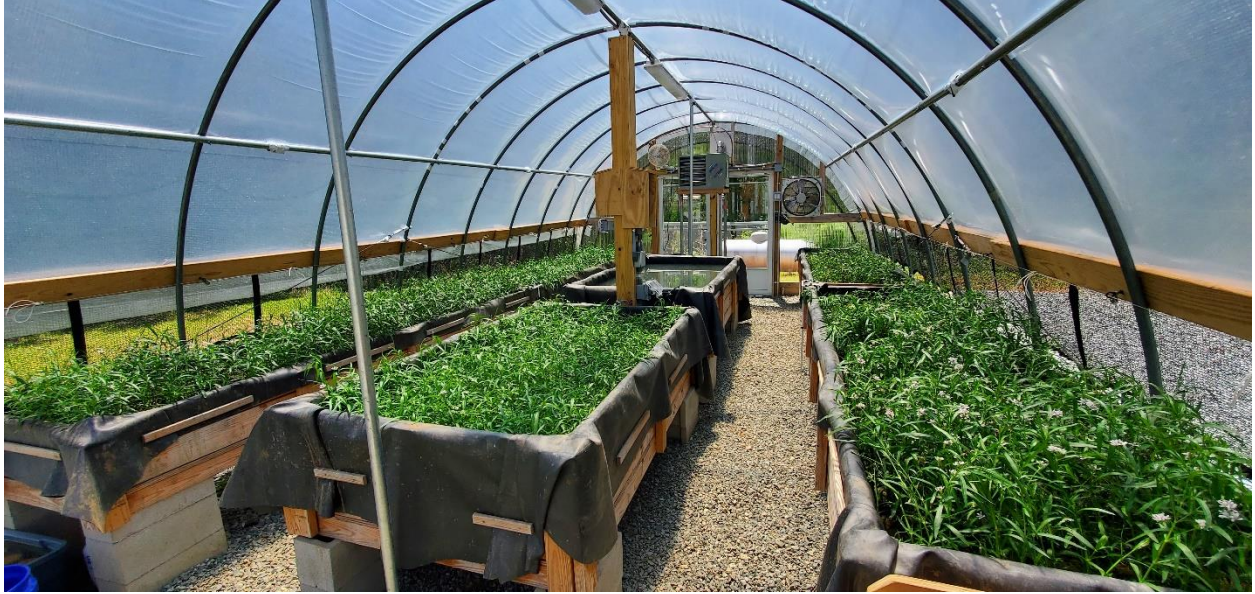
View from inside the greenhouse