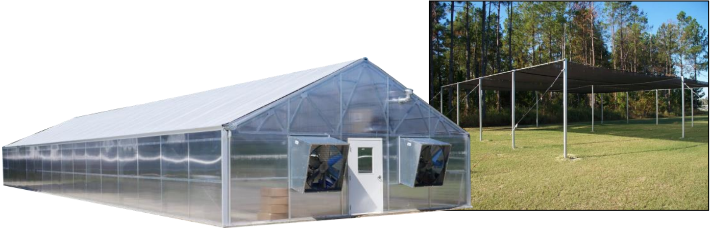
Example of the Proposed Greenhouse