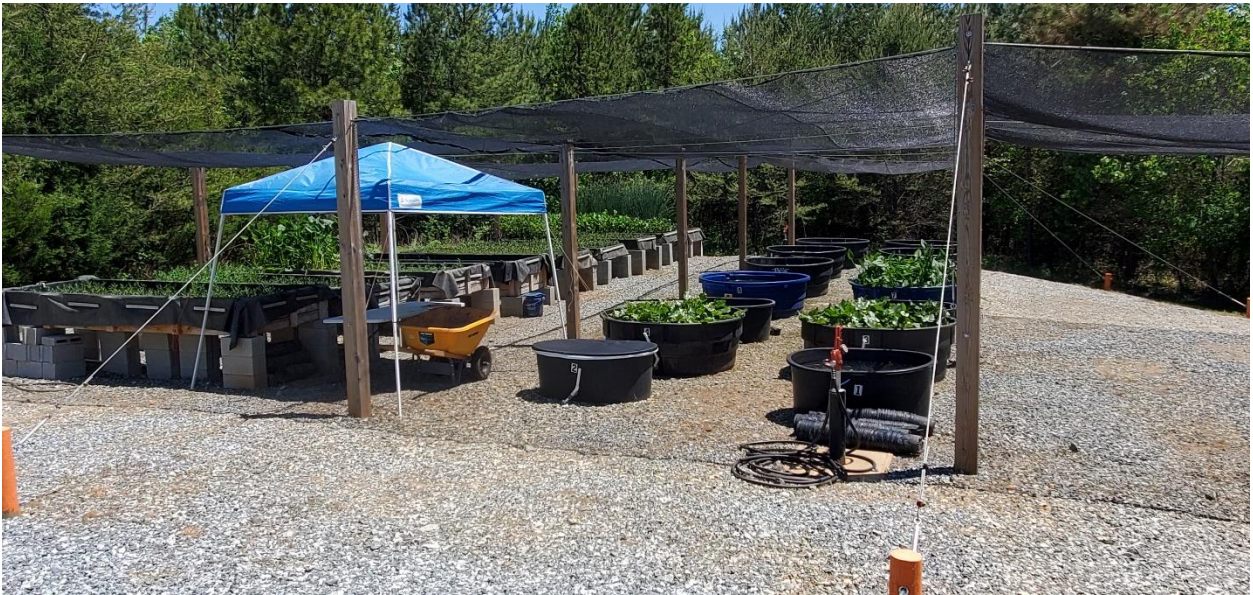
Outside grow yard